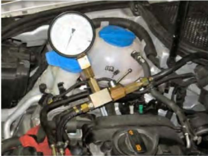
VAG 1318 gauge installed on a 2.0T FSI vehicle.